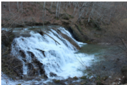
4 - Veliko Tărnovo - Velingrad - 340