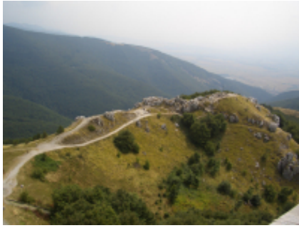
1 - Sofia - Sofia - 0