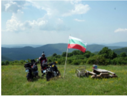
2 - Sofia - Belogradchik - 240