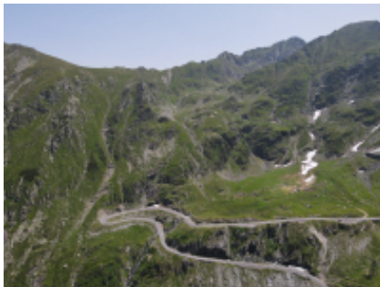
3 - Belogradchik - Veliko Tărnovo - 400