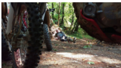
8 - Kardamyli - Atene - 0