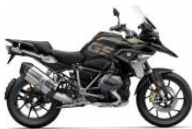
R 1250 GS LC + $92.98