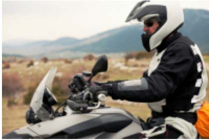
2 - Nauplia - Atene - 170