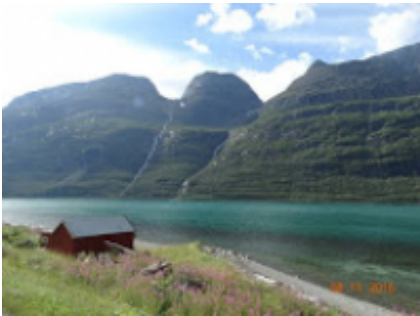
7 - Levi - Levi - 0