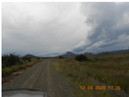
12 - Nieu-Bethesda - Addo -