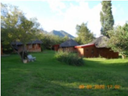
9 - Malealea - Semonkong -