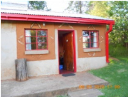
8 - Malealea - Malealea -