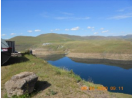
7 - Lejone - Malealea -