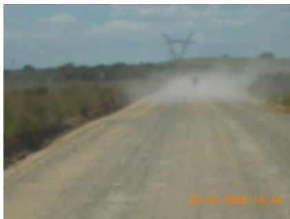
2 - Addo - Hogsback -