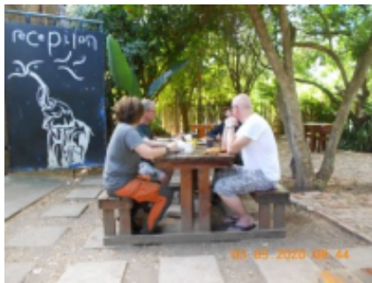
1 - Port Elizabeth - Addo -