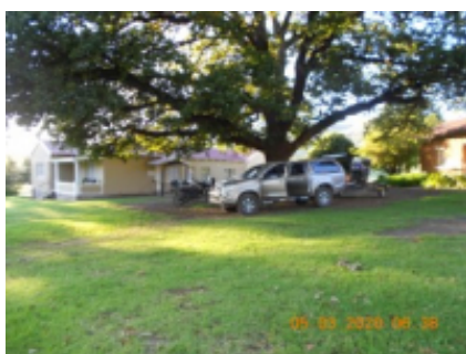
4 - Maclear - Underberg -