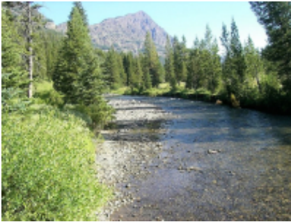
7 - Radium - Calgary - 309