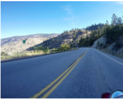
3 - Waterton - Nelson - 269