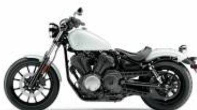
XV 950 Bolt + $700.00