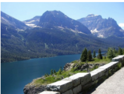
5 - Kelowna - Kelowna - 0