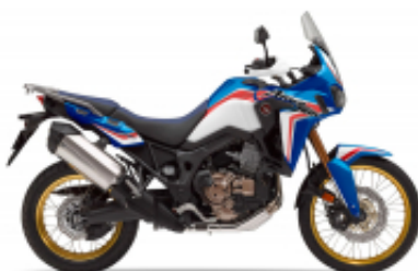
Africa Twin CRF 1000 L + $1,200.00