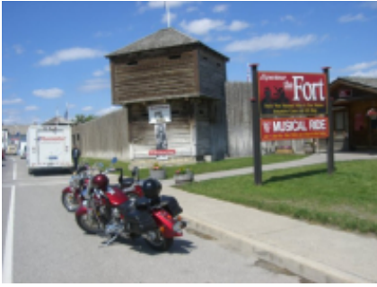
2 - Calgary - Waterton - 430