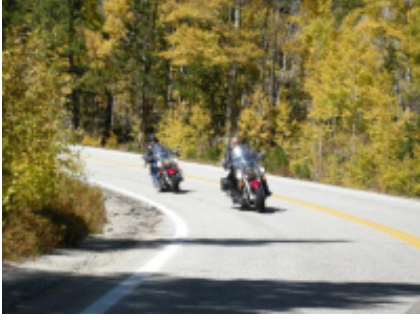
1 - Aeroporto - Calgary - 25