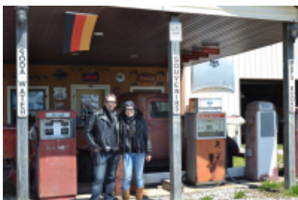
6 - Oljato-Monument Valley - Bryce Canyon City - 544 km