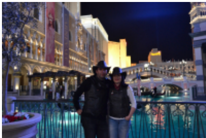
4 - Laughlin - Grand Canyon - 392 km