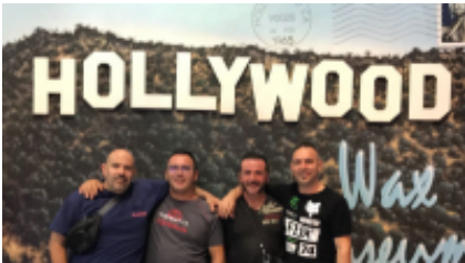
16 - Los Angeles - Los Angeles - 0 km