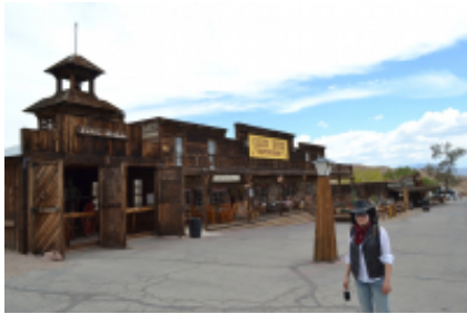
3 - Palm Springs - Laughlin - 371