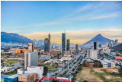
14 - Monterey - Pismo Beach - 243 km