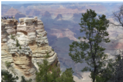
5 - Grand Canyon - Oljato-Monument Valley - 272 km