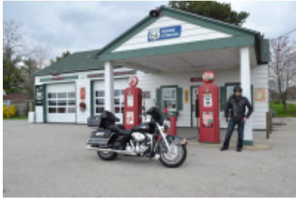
2 - Los Angeles - Palm Springs - 304 km