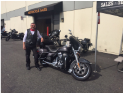
15 - Pismo Beach - Los Angeles - 360 km