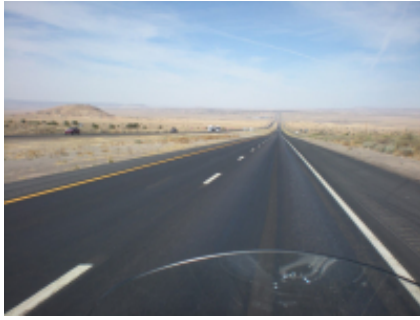
1 - - Los Angeles - 0 km