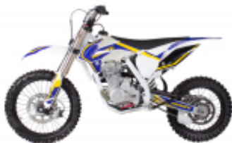
Wing 250 + $0.00