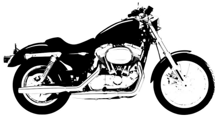
F 800 GS + $2,205.09