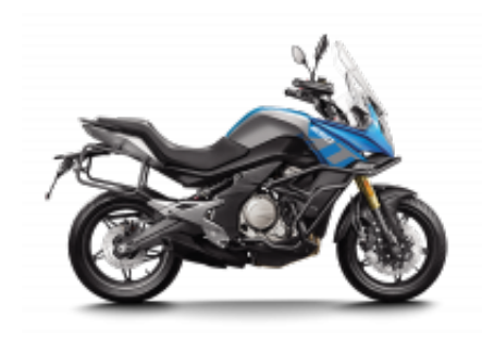
650MT 2022 + $1,206.24