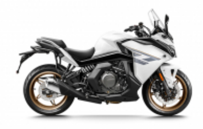
650GT + $1,206.24