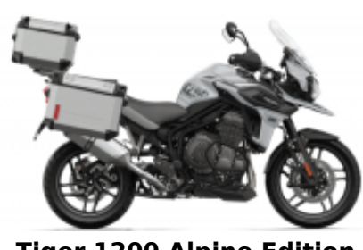
Tiger 1200 Alpine Edition + $2,304.06