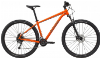
29" Trail 3 + $28.02