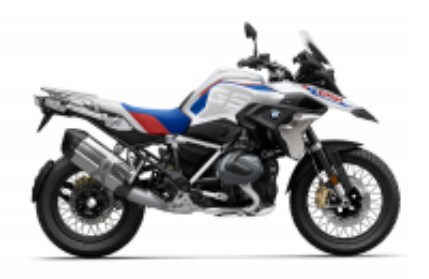
R 1250 GS + $385.78