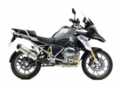
R 1200 GS LC + $292.26