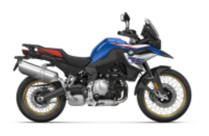
F 850 GS + $292.26