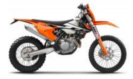
EXC 450 + $0.00