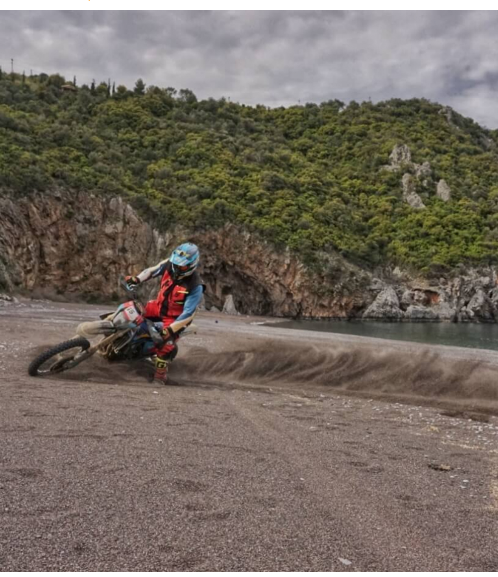
Motorcycle Enduro off Road tour Athens, Greece