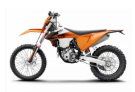
TPI/Six Days 300 + $0.00