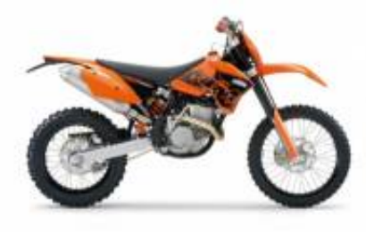
EXC 250 + $0.00