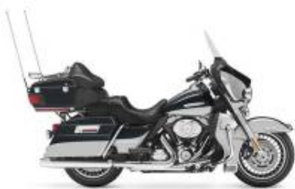
Road Glide Ultra Grand Touring Class + $967.52