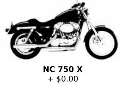
NC 750 X + $0.00