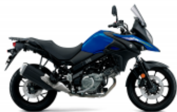
V-STROM 650 + $0.00