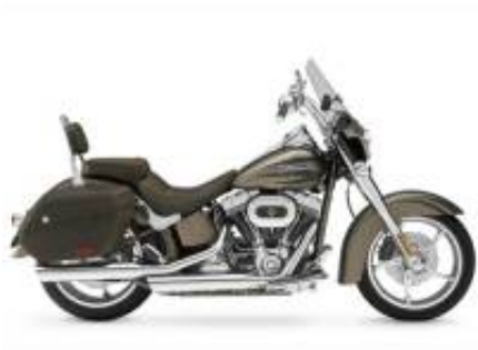
Softail + $973.41