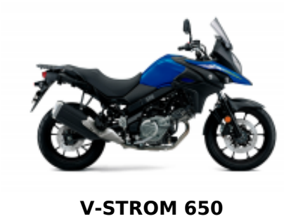
V-STROM 650 + $0.00