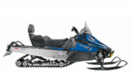
Bearcat XT + $0.00