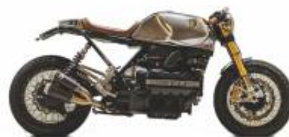
K100 RS Cafe racer + $0.00