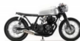
CB 250 Cafe Racer + $0.00