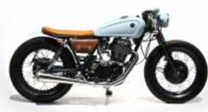
SR 250 Caferacer + $0.00