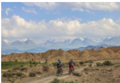
6 - Lac Son Koul - Kotchkor - 65