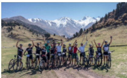
5 - Kotchkor - Lac Son Koul - 60