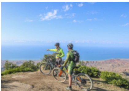
4 - Kegeti - Kotchkor - 75