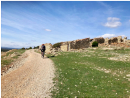
2 - Teruel - Alcalá de la Selva - 60