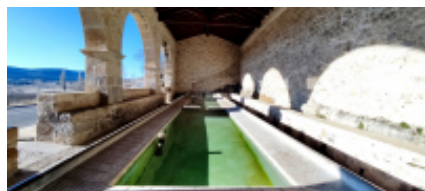
9 - Barcelone - Barcelone - 0