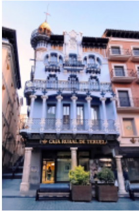
1 - Barcelone - Teruel - 0