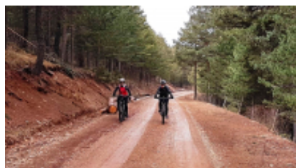
8 - Teruel - Barcelone - 0