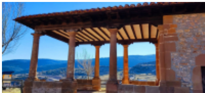
3 - Alcalá de la Selva - Mosqueruela - 54