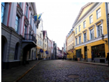
11 - Tallinn - Tallinn -