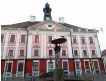
10 - Pärnu - Tallinn -