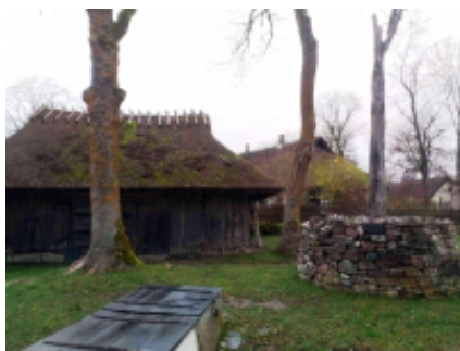
7 - Kuressaare - Koguva - 78