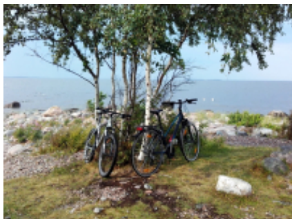
8 - Koguva - Commune de Varbla - 51