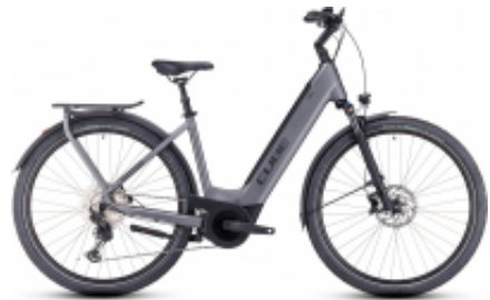
Touring Hybrid 500 Easy Entry + $34.87