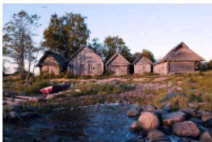
9 - Commune de Varbla - Pärnu - 70