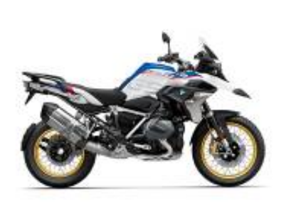
R 1250 GS HP Edition + $0.00