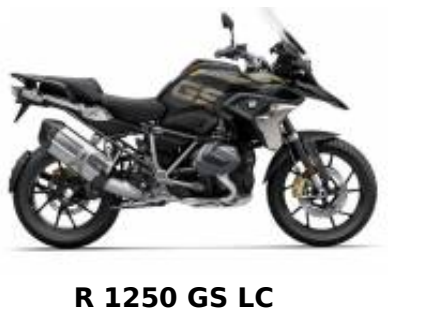
R 1250 GS LC + $0.00