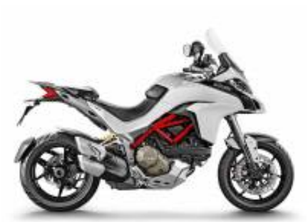
Multistrada 1260 V4 + $0.00