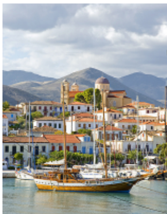
2 - Arachova - Athènes - 200