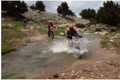
3 - Elmalı - Olympos - 180