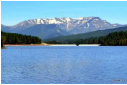
2 - Fethiye - Elmalı - 150