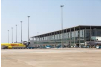
1 - Dalaman Airport - Fethiye - 0