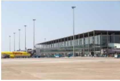
1 - Dalaman Airport - Fethiye - 0