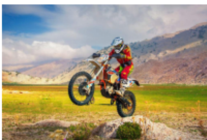
6 - Kaş - Saklıkent National Park - 150