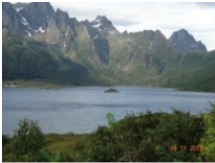
2 - Levi - Alta - 280