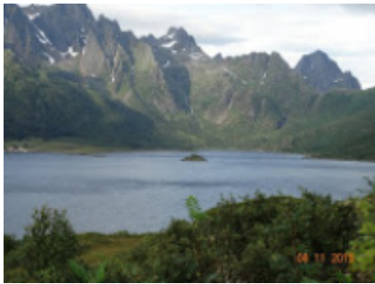
2 - Levi - Alta - 280