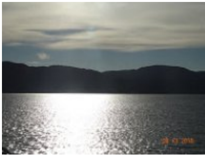
3 - Alta - Honningsvåg - 360