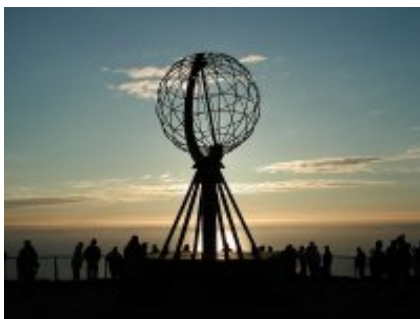
5 - Inari - Saariselkä - 300