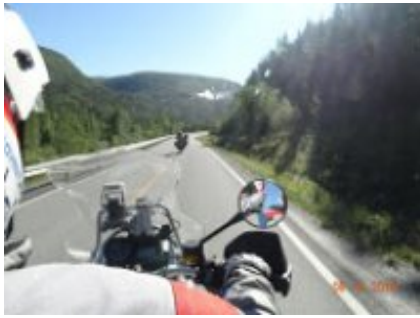
1 - Levi - Levi - 0