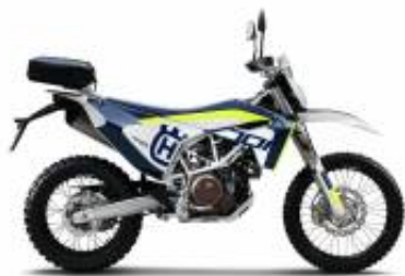
701 Enduro + $0.00