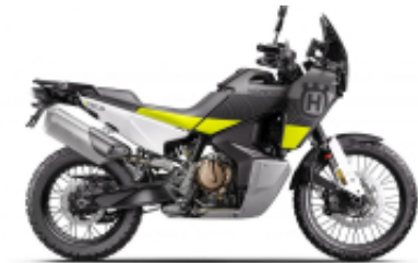
Norden 901 + $0.00