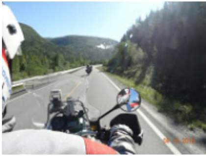
1 - Levi - Levi - 0