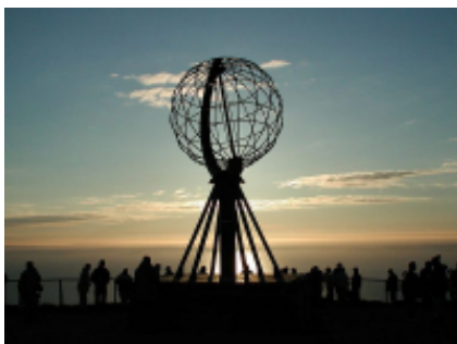
5 - Inari - Saariselkä - 300