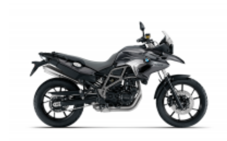
F 700 GS + $222.12