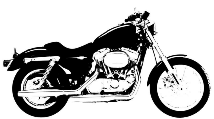
F 800 GS + $362.41