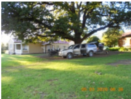
4 - Maclear - Underberg -