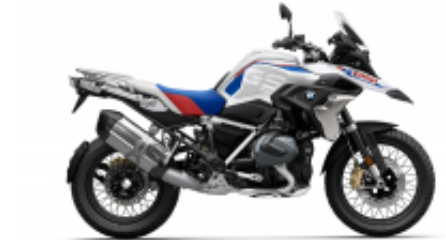
R 1250 GS + $993.70