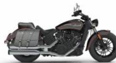
Scout Sixty + $700.00