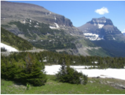
8 - Calgary - Aéroport - 0