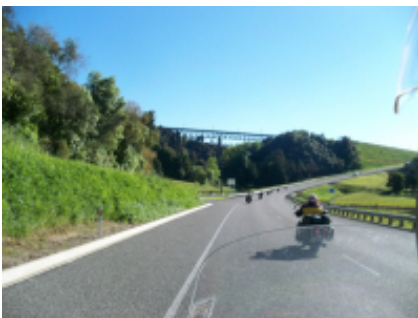
4 - Nelson - Kelowna - 392