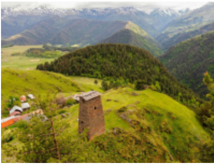
3 - Mtskheta-Mtianeti - Omalo - 140