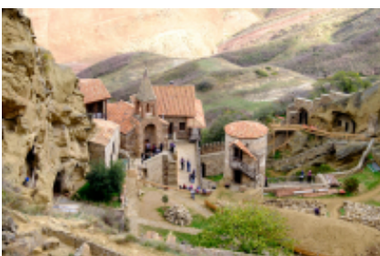
6 - Sighnaghi - Tbilissi - 160