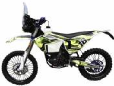
Rally 450 + $0.00