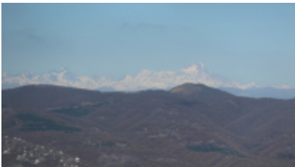
4 - Omalo - Omalo - 60-80