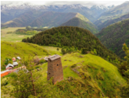
3 - Mtskheta-Mtianeti - Omalo - 140