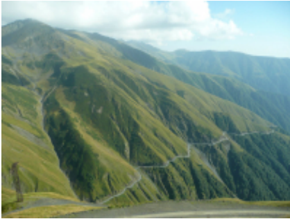
2 - Tbilissi - Mtskheta - 125