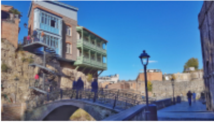
1 - Tbilissi - -