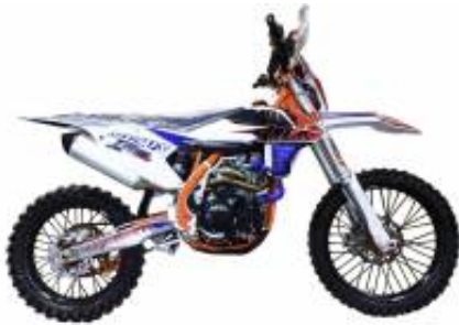
Sixdays 450 + $0.00