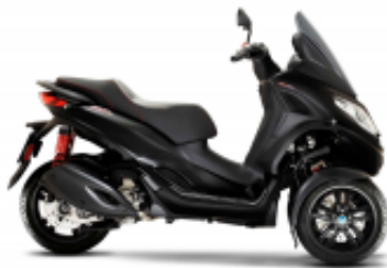
MP3 300 + $0.00