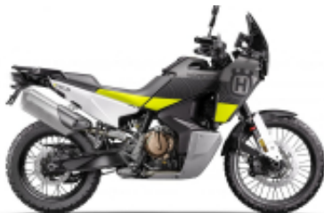
Norden 901 + $0.00