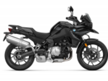
F 750 GS + $2,000.92