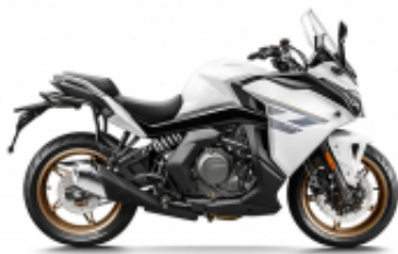
650GT + $1,203.39