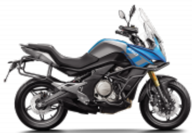
650MT 2022 + $1,203.39