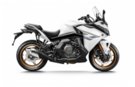
650GT + $1,195.88