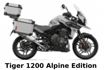
Tiger 1200 Alpine Edition + $2,284.27