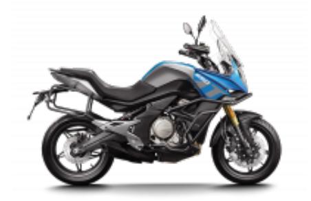
650MT 2022 + $1,195.88