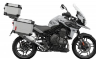
Tiger 1200 Alpine Edition + $2,298.60