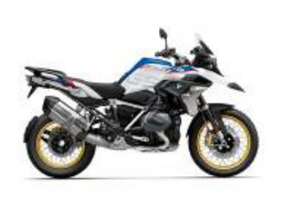
R 1250 GS HP Edition + $0.00