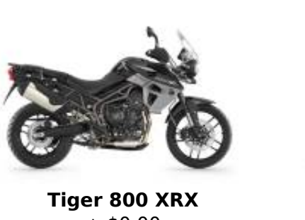
Tiger 800 XRX + $0.00