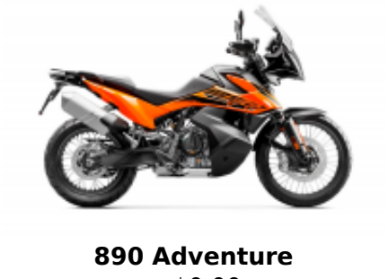
890 Adventure + $0.00