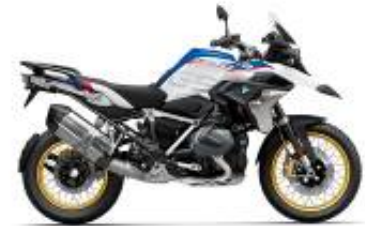
R 1250 GS HP Edition + $0.00