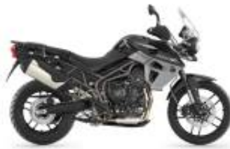
Tiger 800 XRX + $0.00