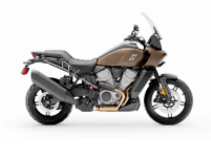
Pan America 1250 + $0.00