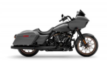
Street Touring Road Glide + $0.00