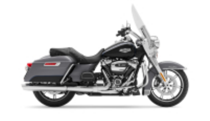
Road King Street Classic Class + $0.00