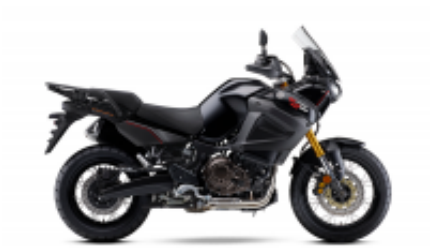
Super Tenere 1200 + $0.00