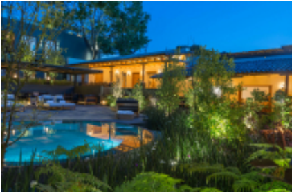
11 - Santiago de Querétaro - Querétaro Intercontinental Airport - Querétaro – Airport (van)