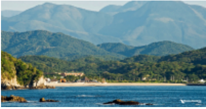
8 - Zacatecas - Guanajuato - Zacatecas – Guanajuato