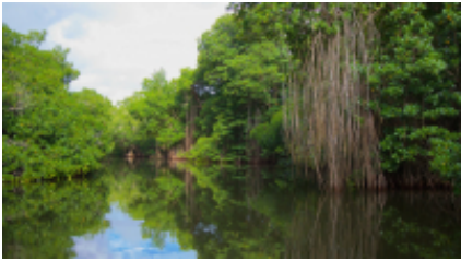
10 - San Miguel de Allende - Santiago de Querétaro - San Miguel Allende – Querataro