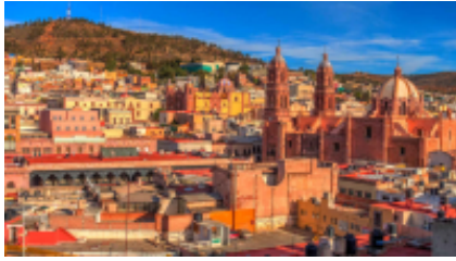
1 - Mexico City - Valle de Bravo - CDMX - Valle de Bravo (van)