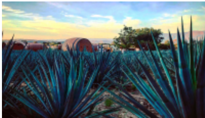
3 - Morelia - Tequila - Morelia - Tequila