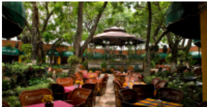
4 - Tequila - Sayulita - Tequila - Sayulita