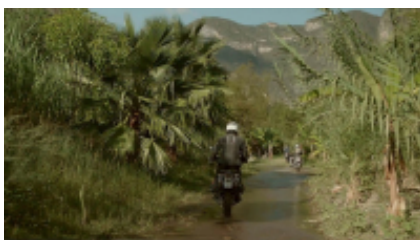
6 - Sayulita - Tlaquepaque - Sayulita - Tlaquepaque