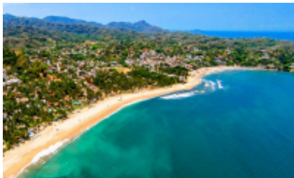
5 - Sayulita - Circuito Sayulita - Sayulita