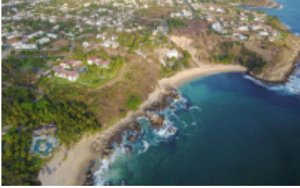
9 - Guanajuato - San Miguel de Allende - Guanajuato – San Miguel Allende