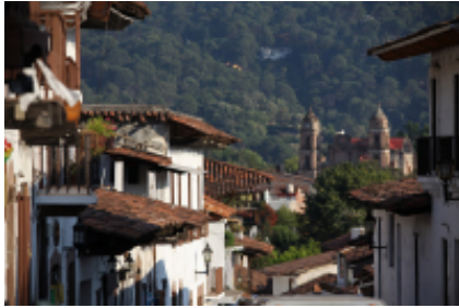
2 - Valle de Bravo - Morelia - Valle de Bravo - Morelia