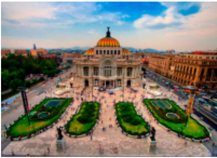
10 - Valle de Bravo - Mexico City - 0 Valle de Bravo - Airport (van)