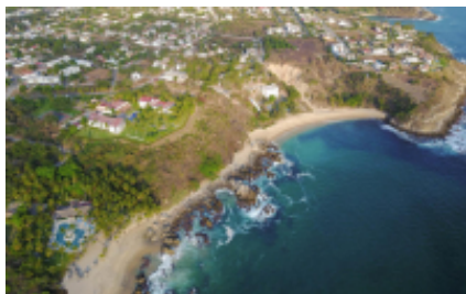
2 - San Juan Teotihuacán - Zimapan - Teotihuacán - La Gloria - Zimapan