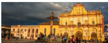
6 - Peña de Bernal - Guanajuato - Peña - San Miguel - Guanajuato