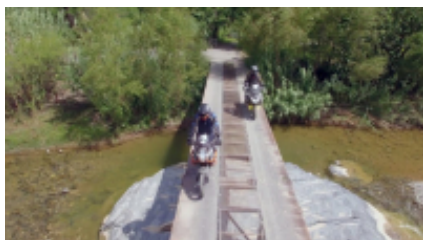
4 - Xilitla - Ciudad Valles - Xilitla - Sótano - Tamul - Ciudad Valles