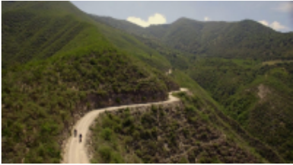
8 - Guanajuato - Morelia - Guanajuato - Morelia