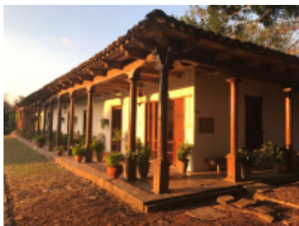
5 - Ciudad Valles - Peña de Bernal - Ciudad Valles - Peña de Bernal