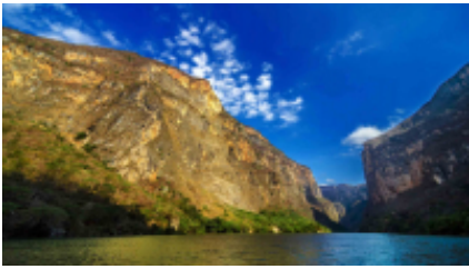
9 - Morelia - Valle de Bravo - Morelia - Valle de Bravo