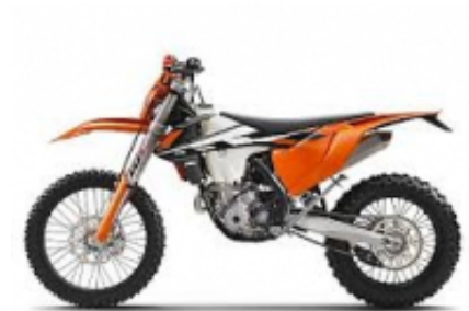
EXC 350 + $0.00