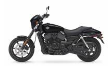
Street 750 + $0.00