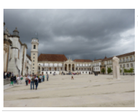
5 - Tomar - Mira - 166

Visit to the medieval city of Obidos. City of Porto and Tomar. Night in Tomar.