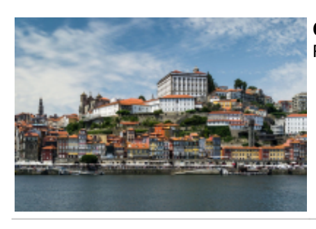
6 - Mira - Porto - 99

Return to Mira, with visit to the city of Coimbra. Night in Mira.