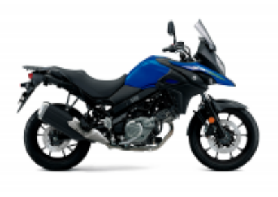
V-STROM 650 + $0.00