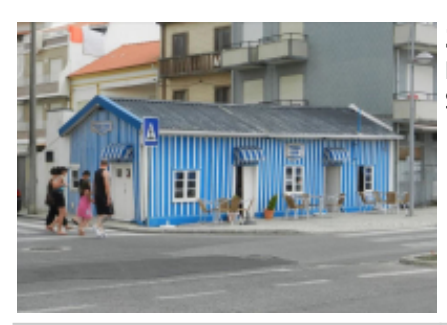
3 - Mira - Foz do Arelho - 260

Route between Mira and Foz de Arelho. Discovery of Figueira da Foz Nazaré, São Martinho and Foz de Arelho. Night in Foz de Arelho.