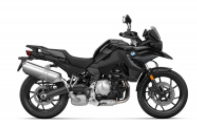
F 750 GS + $0.00