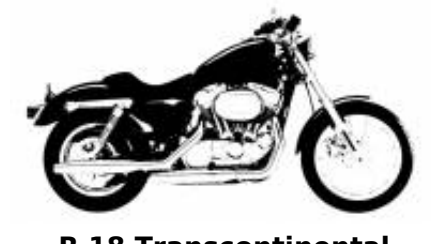
R 18 Transcontinental + $677.38