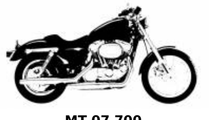
MT 07 700 + $0.00