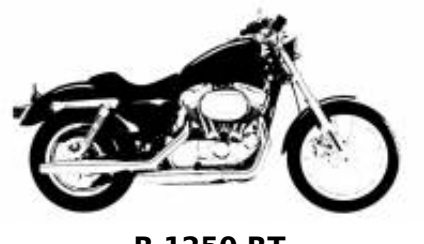
R 1250 RT + $335.77