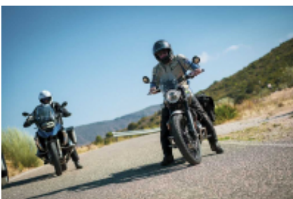
5 - Córdoba - Sevilla - 314