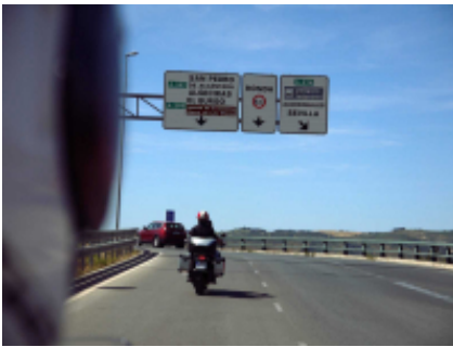
3 - Capileira - San José - 171