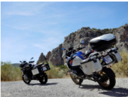
4 - San José - Córdoba - 230