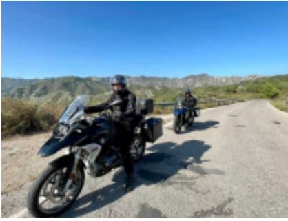
2 - Málaga - Capileira - 198