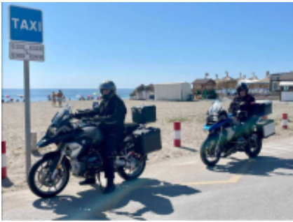
7 - Ronda - Málaga - 181