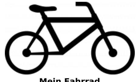
Mein Fahrrad + $0.00