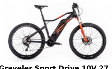
Graveler Sport Drive 10V 27,5 20.ETM.30 + $53.01