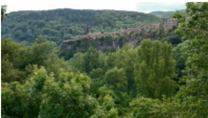
3 - Les Preses - Besalú - 60