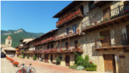
2 - Girona - Les Preses - 65