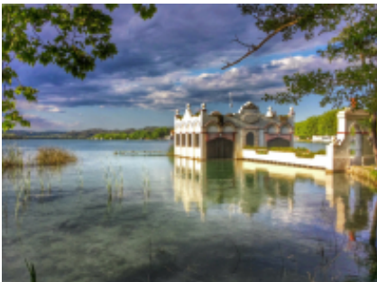
5 - Banyoles - Girona - 31