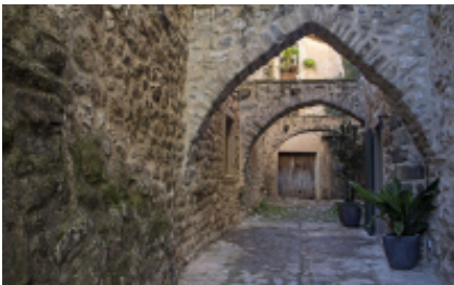
4 - Besalú - Banyoles - 36