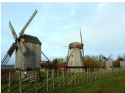
6 - Saaremaa - Arensburg - 51