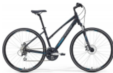
Crossway 20 Lady