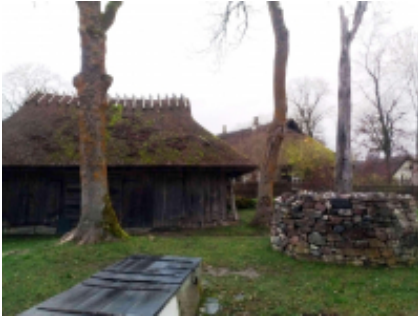
7 - Arensburg - Koguva - 78