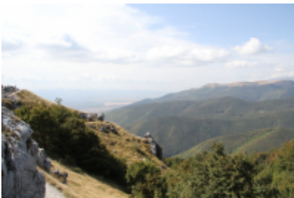
5 - Welingrad - Welingrad - 0