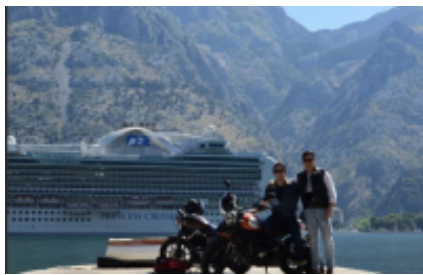
7 - Dubrovnik - Pelješac - 130