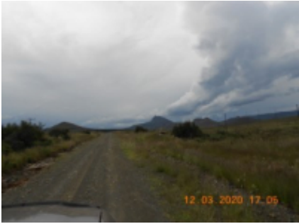
12 - New Bethesda - Addo -