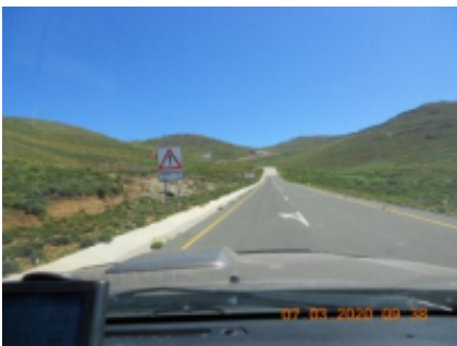
11 - Bethel - New Bethesda -