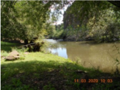
9 - Malealea - Semonkong -