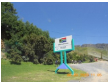
5 - Underberg - Sanipass -