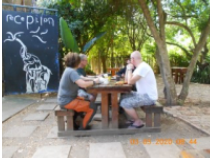
1 - Port Elizabeth - Addo -