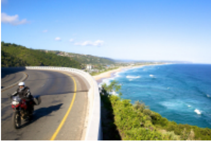
8 - Oudtshoorn - Addo -