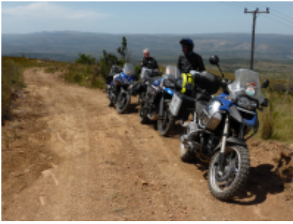
2 - Addo - Port Alfred -