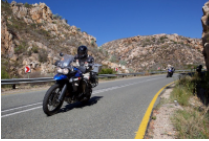
3 - Port Alfred - Avontuur -