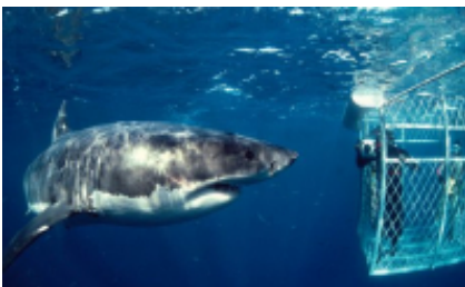
5 - Mossel Bay - Mossel Bay -