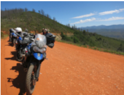
4 - Avontuur - Mossel Bay -