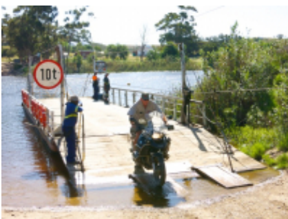
6 - Mossel Bay - Kap Agulhas -