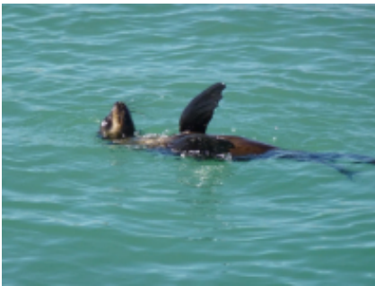
10 - Addo - Flughafen Port Elizabeth -