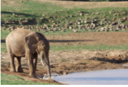
1 - Flughafen Port Elizabeth - Addo -