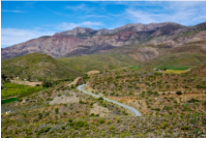
7 - Kap Agulhas - Oudtshoorn -