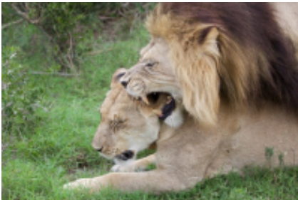
9 - Addo - Addo Elephant National Park -