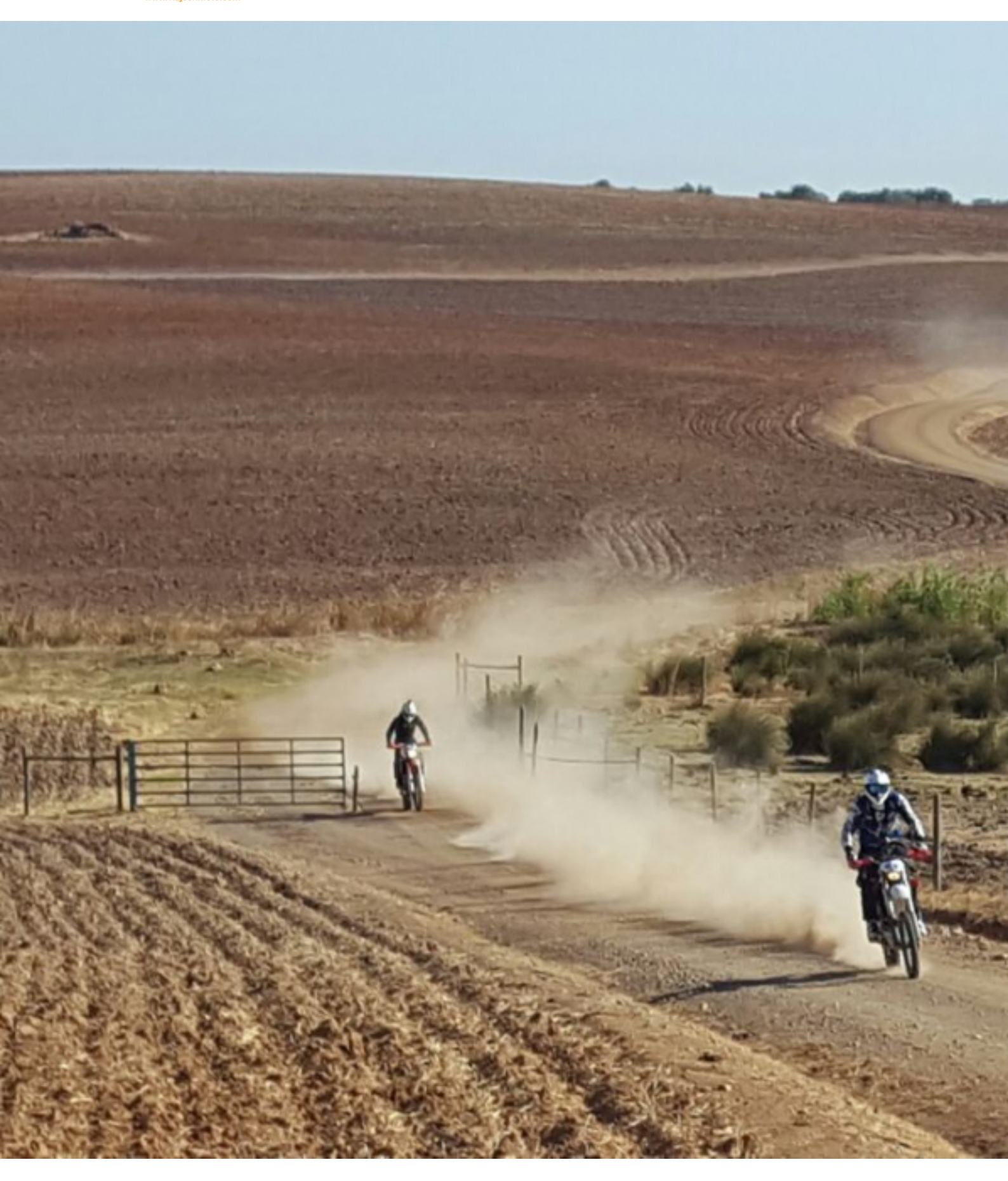
Motorcycle Enduro off Road tour Big Lake tour Portugal