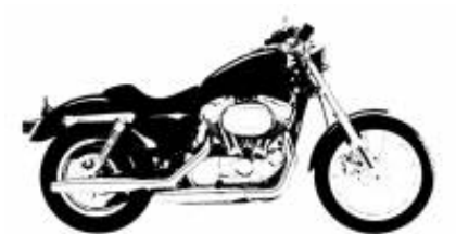
4 - Monchique - Vila Nova de Milfontes - 200