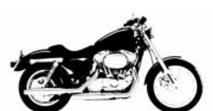
5 - Vila Nova de Milfontes - Abela - 170