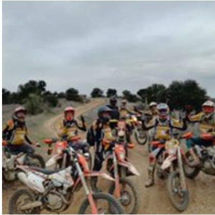
1 - Lissabon - Abela - 0