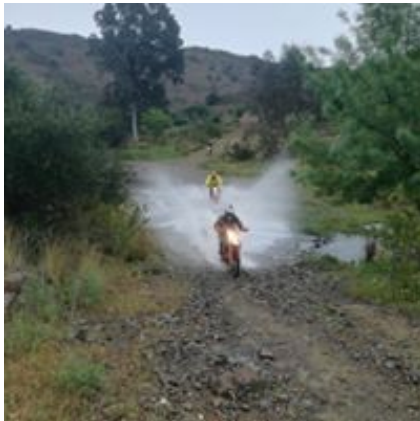
2 - Abela - Tavira - 191