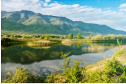
2 - Kerkini-See - Fort Roupel - 52