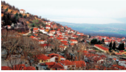
1 - GS Traveler Moto Rentals - Kerkini Lake National Park - 594