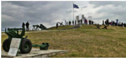
3 - Serres - Alistratis Cave Jeskyne - 63