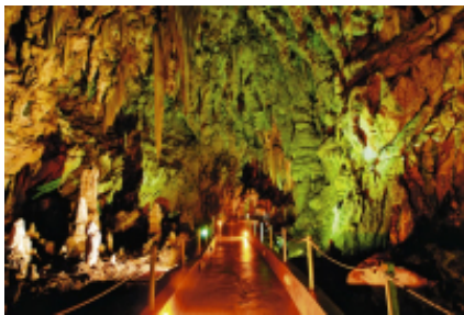
4 - Palaios Panteleimonas, Historical Mountain Village - GS Traveler Moto Rentals - 410