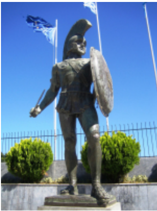
3 - Monemvasia - GS Traveler Moto Rentals - 324