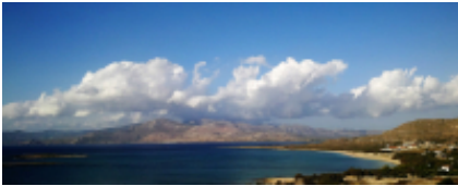
2 - Monemvasia - Monemvasia - 78