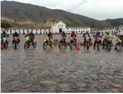
1 - Bogotá - Villa de Leyva -