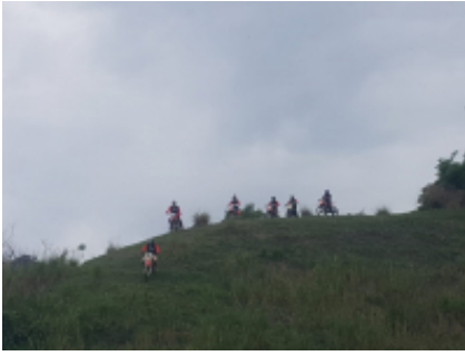
8 - Hotel Termales Del Ruiz - Salento -