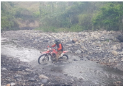
3 - Ubaté - Pacho -