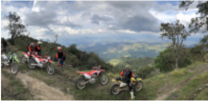
2 - Villa de Leyva - Ubaté -