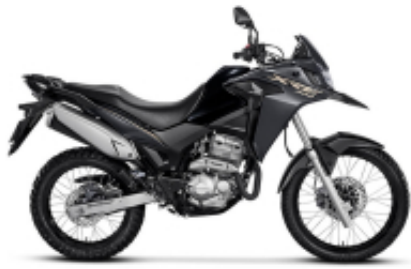
XRE300 + $0.00