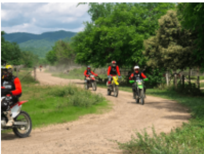
5 - Villeta - Honda -