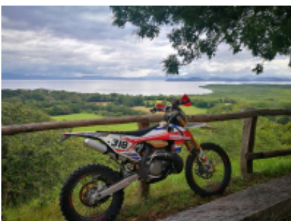
6 - Honda - Honda -