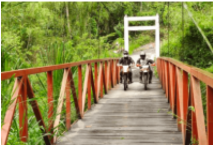
4 - Pacho - Villeta -